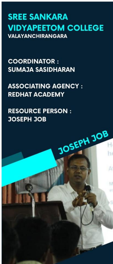
POSTER / BROCHURE