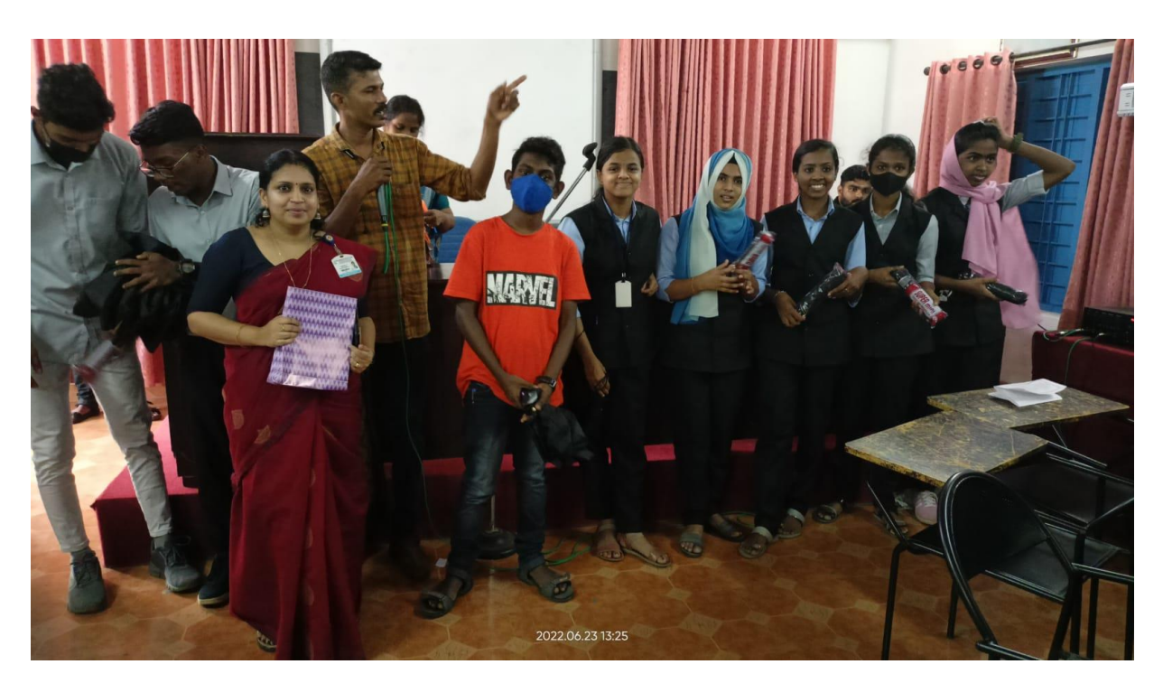
Figure 5 Participants with resource person showcasing the finished products