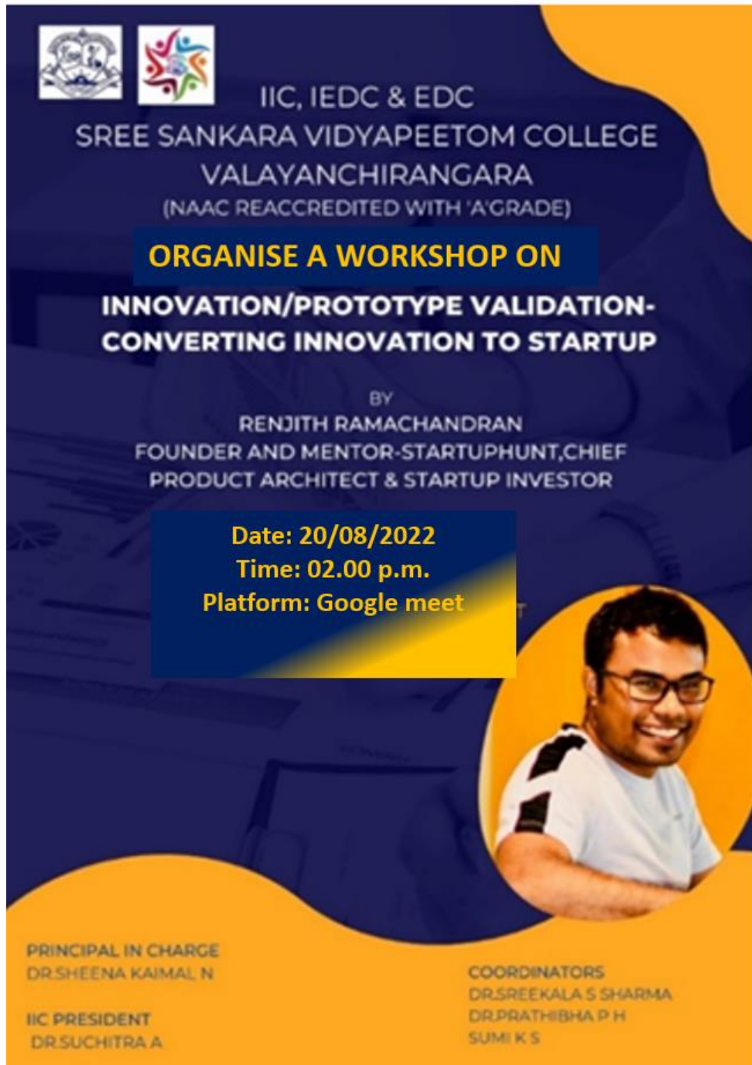
Figure 1 Brochure of the event