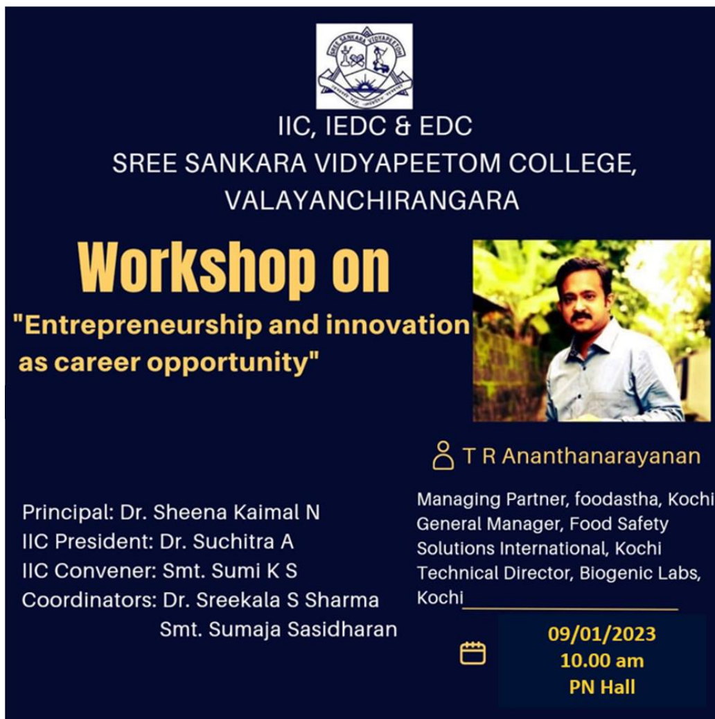
Figure 1 Brochure of the event