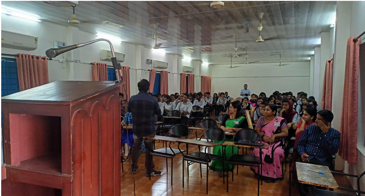
Figure 2 Resource person interacting with participants