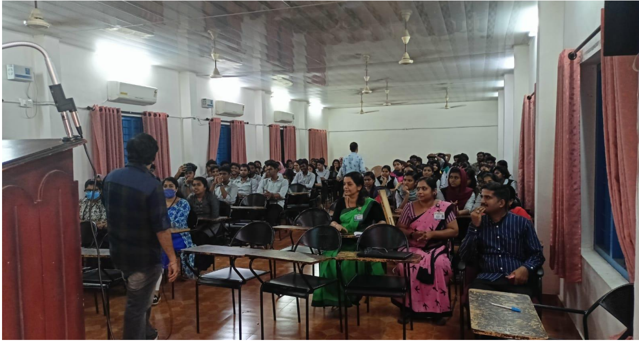
Figure 4 Question & answer session