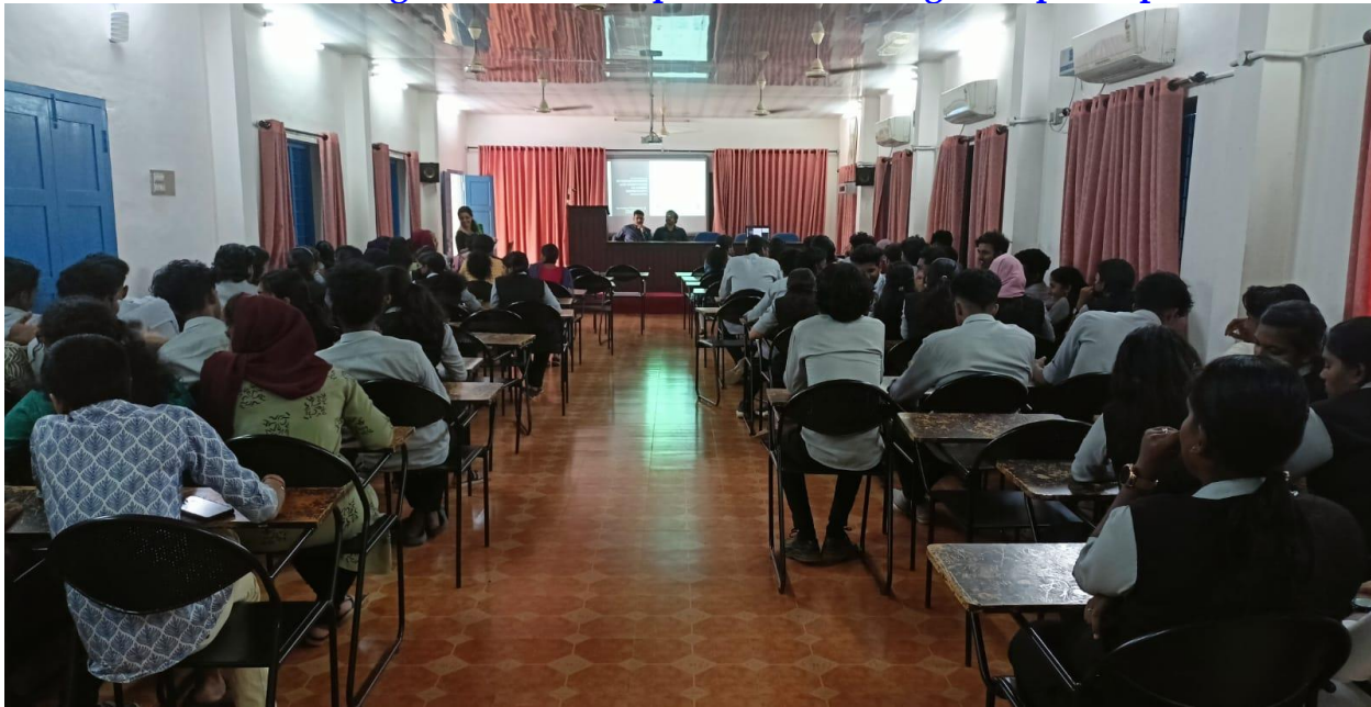
Figure 3 Questionnaire distribution by Coordinator of the programme