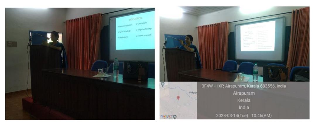
Figure 2 Resource person interacting with participants