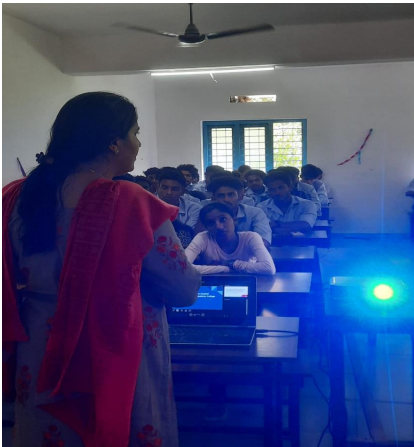
Figure 3 Resource person interacting with the participants