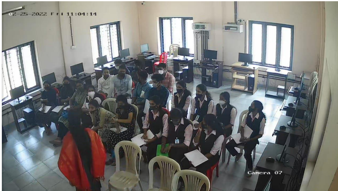
Figure 2 Resource person interacting with participants