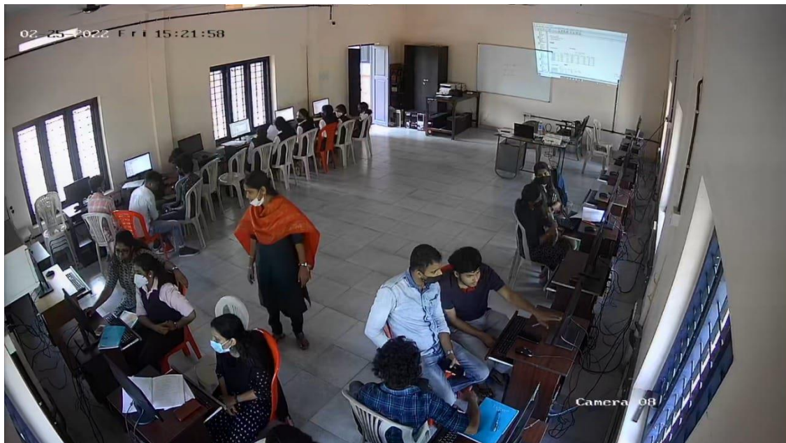
Figure 3 Resource person giving hands on experience on SPSS