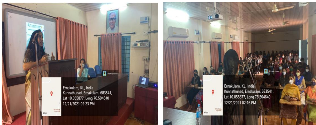
Figure 4 Resource person interacting with the participants