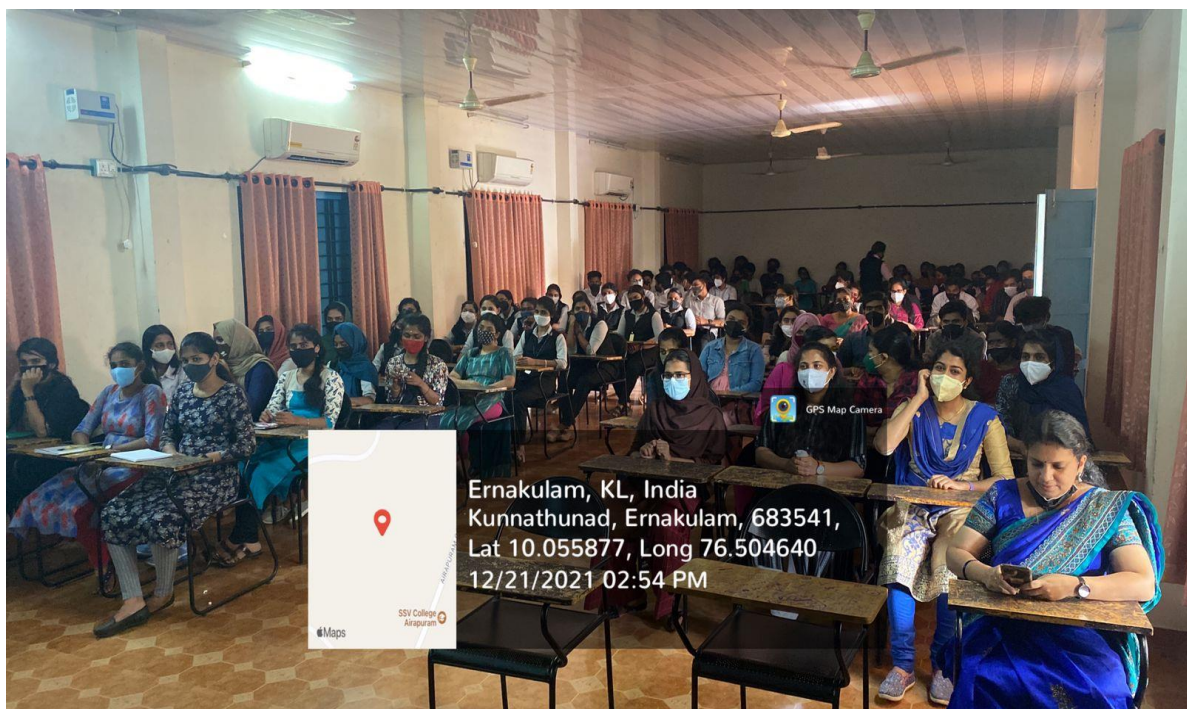
Figure 3 Participants of the workshop