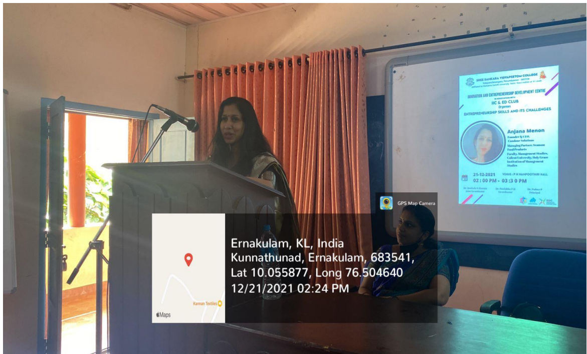
Figure 2 Keynote address by the resource person