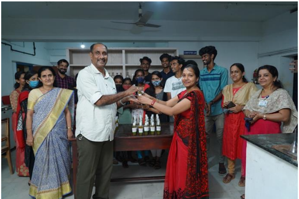
Figure 3 First sale- HOD handing over veg wash to the Manager