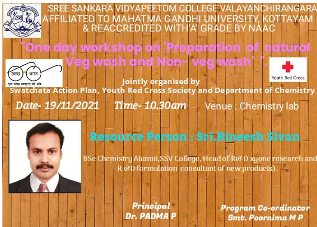
Figure 1 Brochure of the event