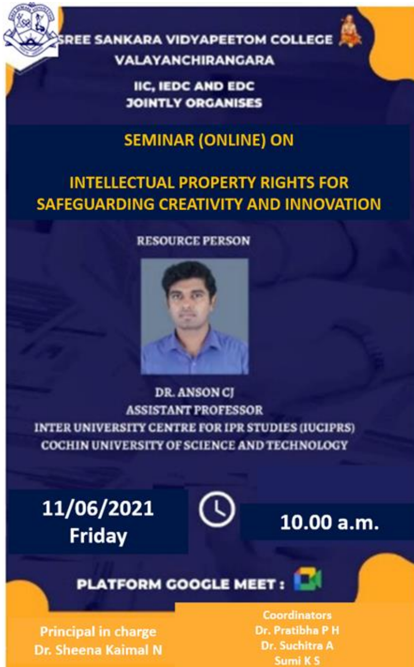
Figure 1 Brochure of the event