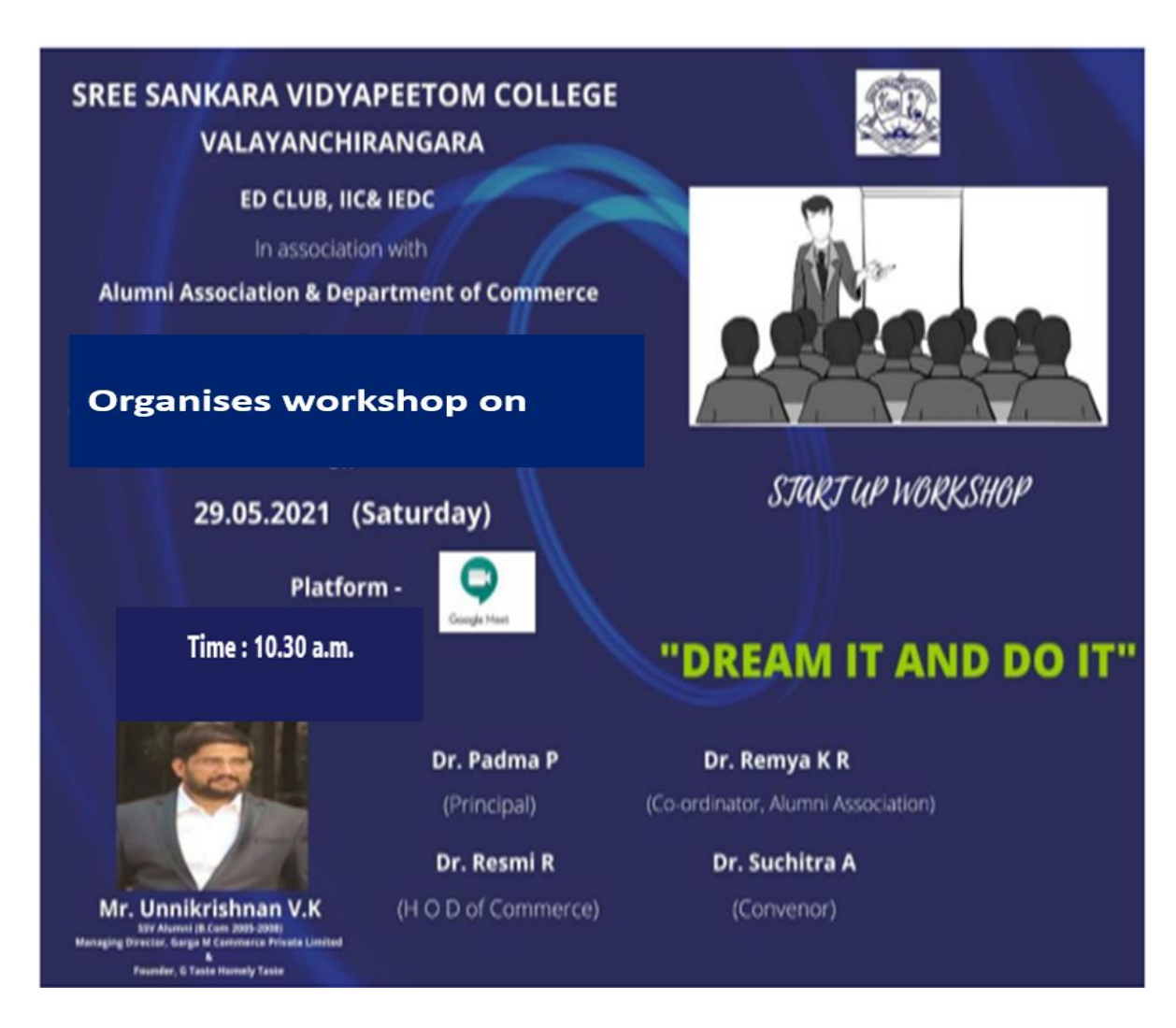
Figure 1 Brochure of the event