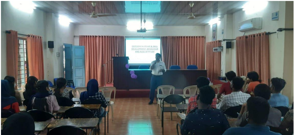
Figure 2 Resource person interacting with participants