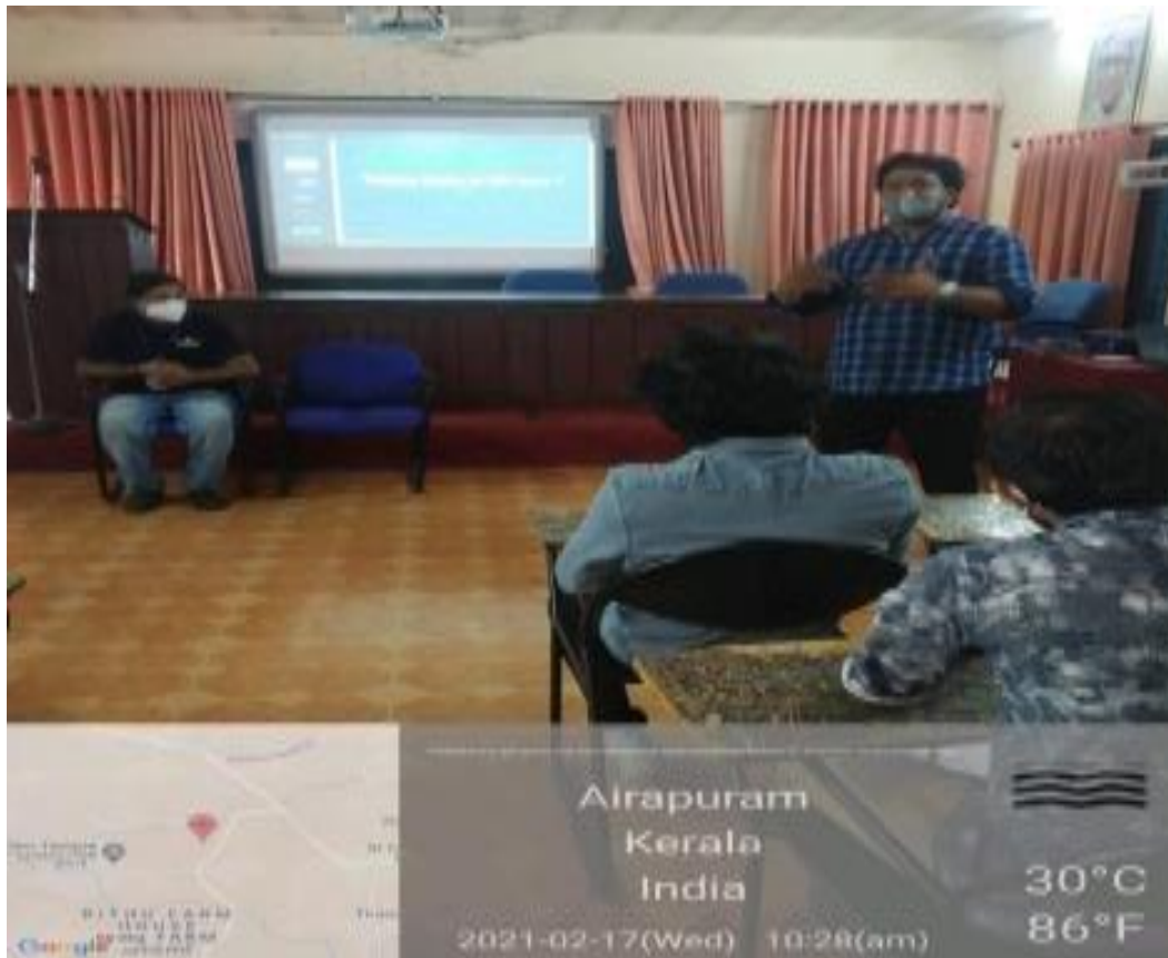
Figure 2 Resource person interacting with participants