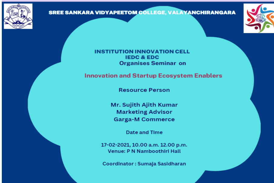
Figure 1 Brochure of the event