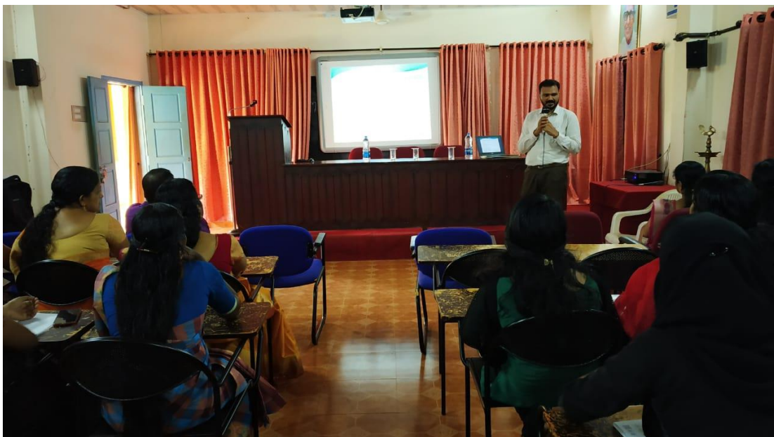
Figure 3 Resource person interacting with the participants