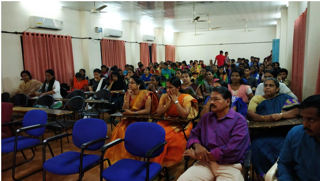
Figure 2 Participants of the event