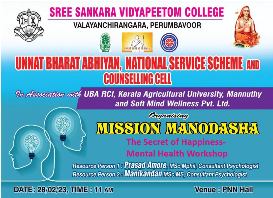
Inauguration- Mission Manodasha