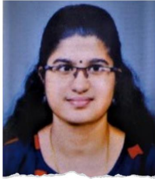
2nd Position HINDI