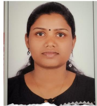
10th Position HINDI