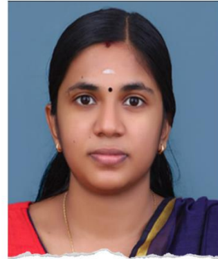
9th Position HINDI