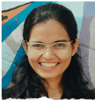
10th Position -----