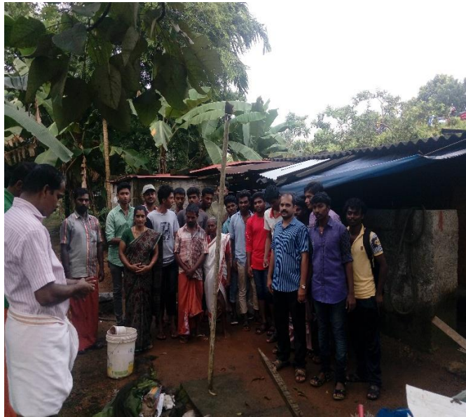
House before demolition